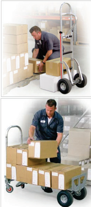
Figure 1. Example vertical and horizontal usage scenarios for Magliner hand trucks.