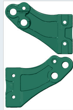
Figure 4. Final optimized design, smoothed for tooling.